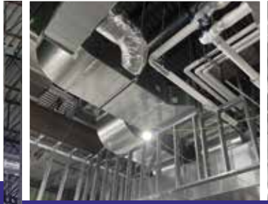
Humboldt Park Health Wellness Center