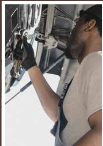
Fleet risk management was discussed

01.13.25 - 01.16.25 | FORT LAUDERDALE, FLORIDA