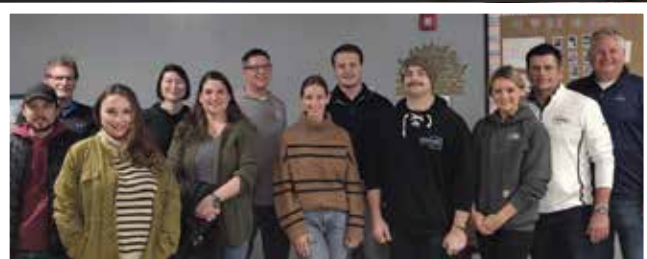
Members packed 144 boxes supplying 85 kids a meal for a year

Weather around the holidays is unpredictable, so we got a little nervous when the forecast called for the first snow of the season on November 21 — the date of our group volunteering activity. The snow came — but it didn't stop our members from turning hunger into hope at the Feed My Starving Children meal packing event in Aurora.