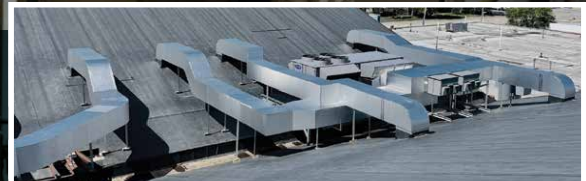
Marist Sports Complex

"IN LIFE, EVERYONE ALWAYS TALKS ABOUT BALANCE BUT YOU FORGET THAT BALANCE MEANS REALLY GOOD, UPLIFTING THINGS AND ALSO EQUALLY HARD THINGS AND HEARTBREAK. HOW WE RESPOND DURING THOSE TIMES IS A TESTAMENT TO CHARACTER."