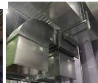
Humboldt Park Health Wellness Center

Another high-profile project currently underway is the Humboldt Park Health Wellness Center, state-of-the-art, 45,000-square-foot facility designed to serve as a hub for wellness, culture and community. The center will provide incomparable facilities, services and programming while showcasing local artists' work throughout its multi-level space.